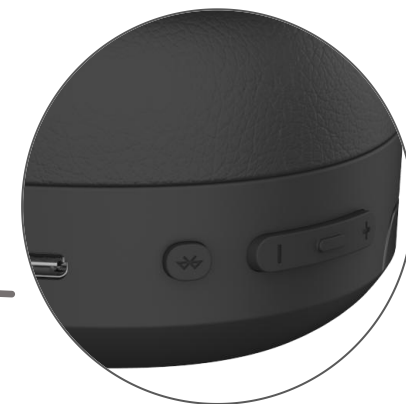
Silicone physical buttons